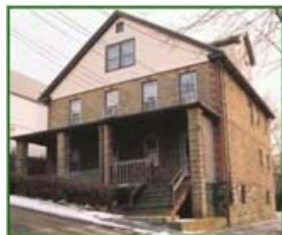
5 Berrian Street $1,000 per month