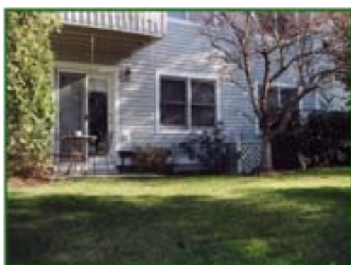
351 Pemberwick Road #912 $595,000

Some of our great listings! If you would like any further information, please call us at 531-6300