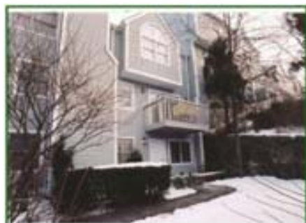
351 Pemberwick Road #206 $1,550 per month