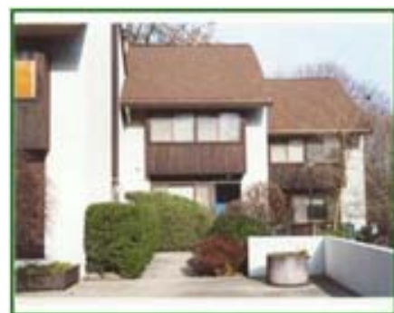
160 Mead Avenue #G $2,000 per month

Some of our great listings! If you would like any further information, please call us at 531-6300