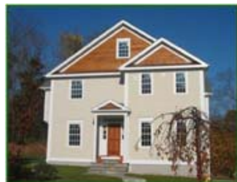
221 Glenville Road $1,860,000