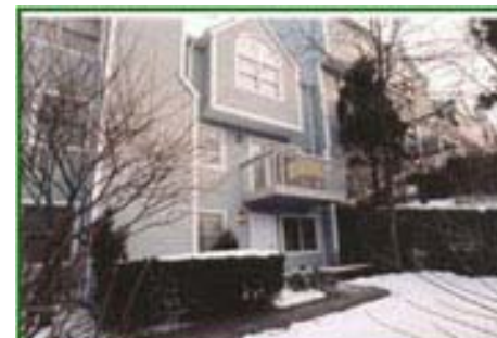
351 Pemberwick Road #206 $1,550 per month

If you would like any further information, please call us at 531-6300