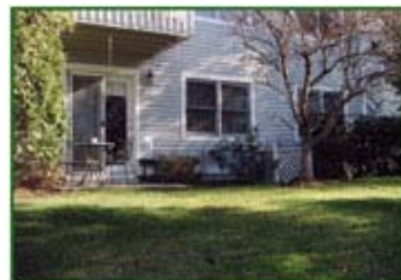
351 Pemberwick Road #912 $595,000