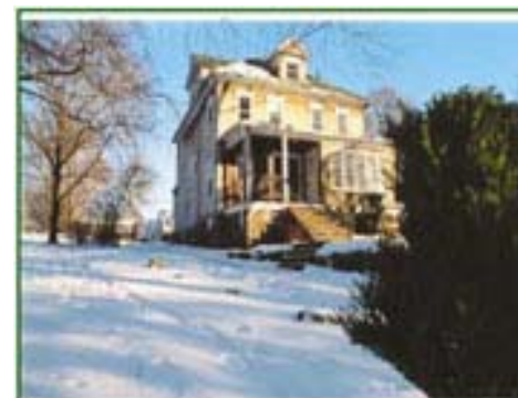
255 Milbank Avenue $3,300 per month