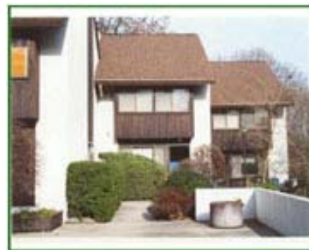
160 Mead Avenue #G $1,850 per month

To view properties, like these, that are currently on the market, please contact our Southwestern Greenwich Office at: 531-6300