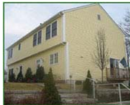
18 Arther Street Unit B $595,000